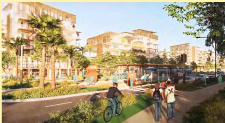
ABOVE: A scene from Council's planning scheme video. RIGHT: The Honey Farm Road Sports & Recreation Precinct plan.

The site, opposite Corbould Park Racecourse, will also feature playgrounds, nature trails, wetlands, dog-friendly areas and spaces for community events.