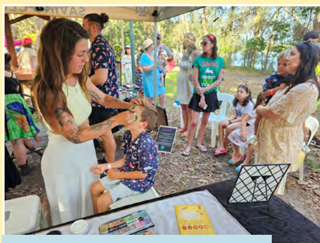
FAMILY FUN: Face-painting and children's activities were a hit.