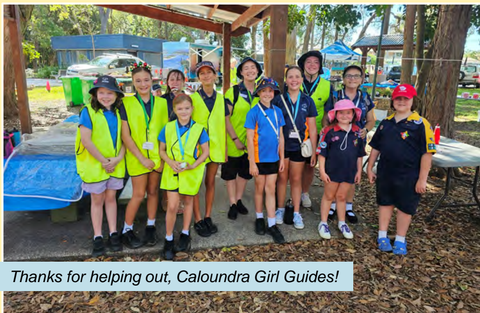
Thanks for helping out, Caloundra Girl Guides!