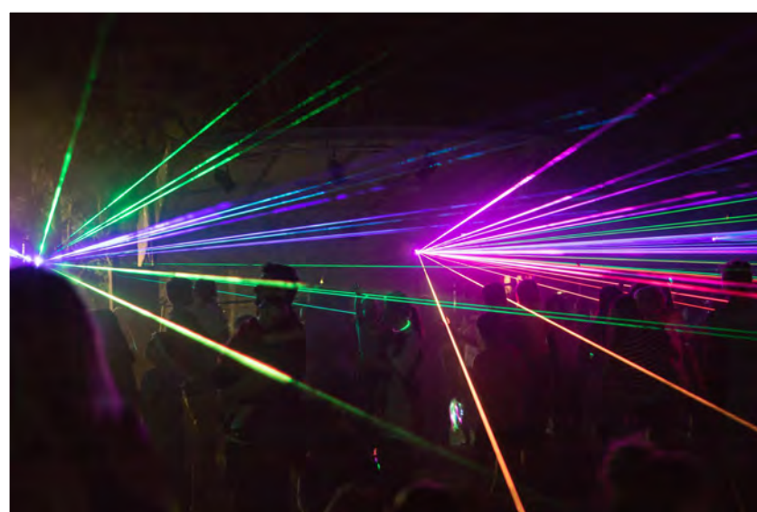
The twilight Christmas boat parade (left) and laser light show (above) are just some of the crowd-pleasing highlights of Lights On The Lake.