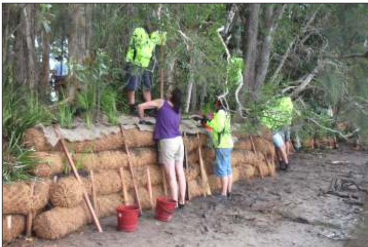
CCCG volunteers installing coir log walls on the banks of the lake in 2014