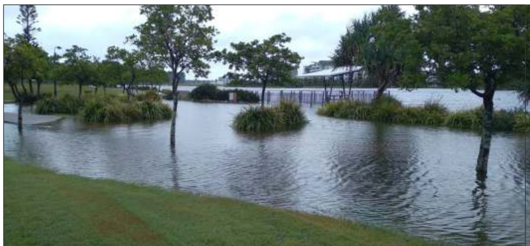
Moderate flooding in Lake Kawana

We all know that extreme weather events have an enormous social and economic cost for Australia.