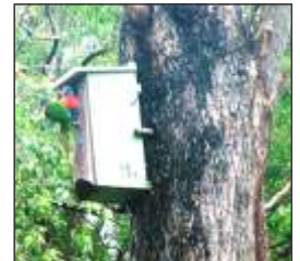
Nest boxes home to rainbow lorikeets