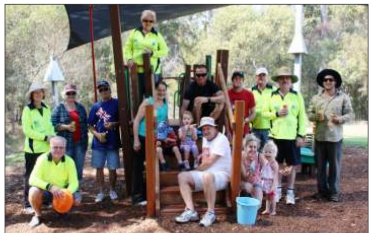
A typical group of volunteer weeders in 2012 enjoying the famous sausage sizzle and drink

So congratulations Currimundi Catchment Care Group and good luck for the future!