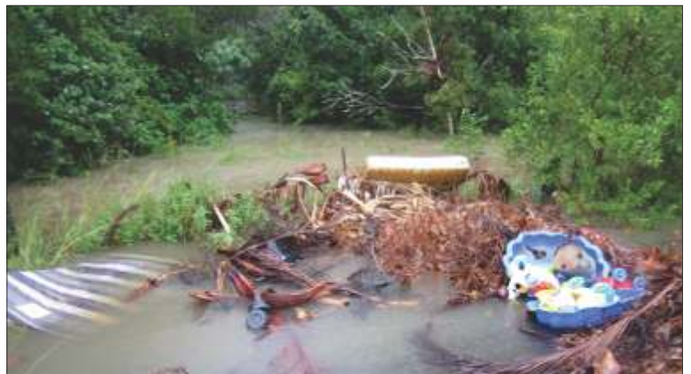
Large household items dumped along road to Meridan Playing Fields

But small items such as drink containers are not the only litter problem in the Currimundi Catchment. Unfortunately large household rubbish continues to be illegally dumped along the banks and into parks or directly into the waterways by people who are too lazy to drive to the refuse station. When there is heavy rain these items create an even bigger problem as they are swept along into the waterways.