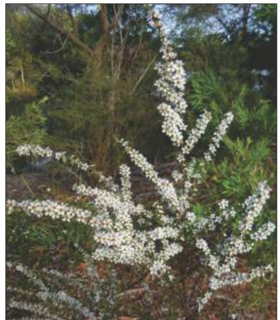
Leptospermum or tea tree in Ivadale Lakes