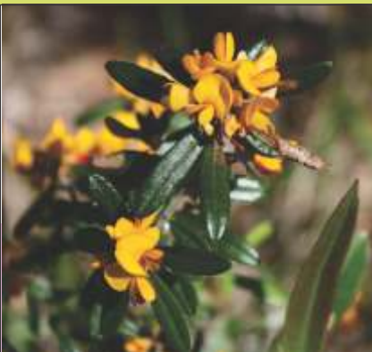
Pultenaea or bush pea in Leacy's Reserve

But of course you don't need to go on a guided walk to appreciate the wildflowers around the catchment. This beautiful white Leptospermum or tea tree flower was photographed at Ivadale Lakes and there are flowers of many varieties and colours to be seen in the wallum heathland of Kathleen McArthur Regional Park, particularly on the north-south running Moondarra Track.